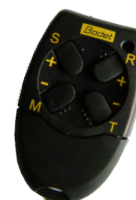
Wireless remote control