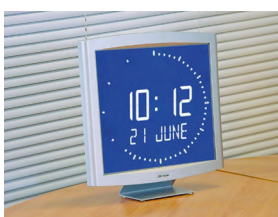
Opalys Ellipse on table support