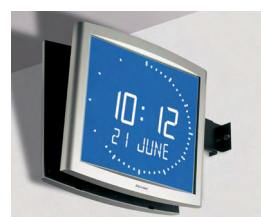
Opalys Ellipse on double-sided bracket