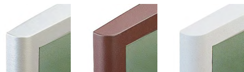
3 casing colours: aluminium, burgundy, white.

Add to the reference: A for aluminium casing colour, B for white, D for burgundy.